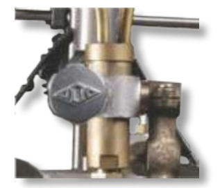
Graduated Bevel Collar

The cutting machine can easily be set at any part of the pipe that is convenient. Additional chain links are available.